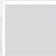
BLUE FOX 14-4804