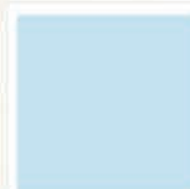
BLUE GLASS 12-5206